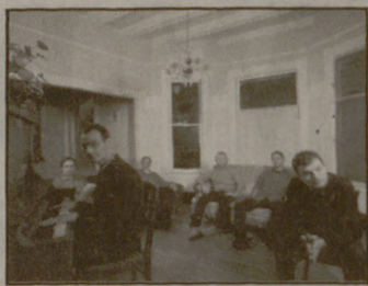
Beulah The Coast is Never Clear Velocette Records

The title of Beulah's latest CD, The Coast is Never Clear , is somewhat of a prophecy. Once the world hears this wonderful mix of strings, horns and harmonized Beach Boy-esque vocals, they will be longing for more Beulah.