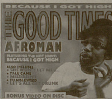
Afroman The Good Times Universal Records

Afroman's Universal debut, The Good Times answers the question, "Is it possible to get high after listening to a CD?" with a deep "Yep" and a long exhale of putrid marijuana smoke.