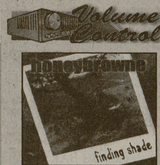
Honeybrowne Finding Shade Levy Records