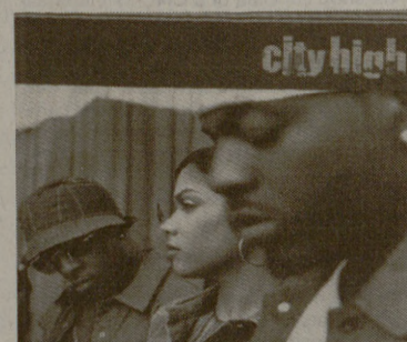
City High City High Booga Basement/ Interscope Records

City High, one of the newest hip-hop/R&B groups, was not only lucky enough to be produced by Wyclef Jean and his cousin Jerry Wonder, but also scored a hit with their first release "What would you do?"