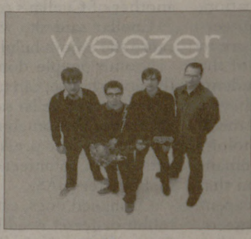
Weezer Weezer Geffen Records

der the Sun," a song in which Mark McGrath recalls his past summers growing up by the beach and, well, under the sun. The sixth track, "Ours," incorporates additional guitars and keyboards and a synthesized sounding McGrath with mellow beats, which is followed by the hard driving, guitar drenched "Sorry Now." One of the best tracks on the album, "Stay On," includes reggae rhythms, background vocals and a Bob Marley rap from McGrath (The only thing missing from this song is two pina colodas and McGrath in my passenger seat). The album also takes an interesting turn in its 10th track, "Just a Little." The song includes twangy country sounds from a pedal steel accompanying funky rock-and-roll beats. The album ends perfectly with "Disasterpiece," which could easily be mistaken for any great rock anthem. The entire album is perfect for summer get-togethers by the pool, and every song will have listeners picturing themselves in a Jeep, driving along beaches on a summer day. (Grade A)