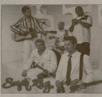
Sugar Ray Sugar Ray Atlantic Records

The self-titled fourth album by Sugar Ray has proved the band is only getting sweeter. The album hit No. 6 on the Billboard charts one week after its release. This album has several musical influences, including reggae, ska, country and of course, good ol' rock and roll. The first track's opening beats gets listeners' heads banging and singing along to the band's simple, catchy lyrics like "Answer the phone, I know that you're home, I wanna get you alone, and do it again, do it again!" The album then moves to more groovy and laid-back beats with true-to-life lyrics like "When it's over, that's the time I fall in love again" in "When It's Over" and "Un-