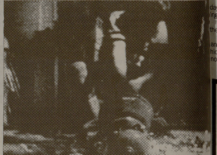
ROCK OPERA