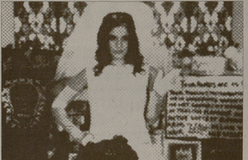
THE GIRLS' ROOM