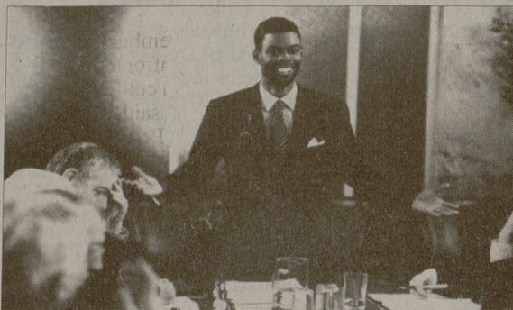
Down to Earth Starring Chris Rock and Regina King Directed by Chris Weitz and Paul Weitz

Down to Earth is a moderately funny movie, that sadly only seems to find its pace whenever Chris Rock is doing a stand-up routine. Rock only performs those routines about four times in the whole movie. That said, one might wonder if they could just stay at home and watch a rerun of Rock's HBO specials, and the answer is yes.