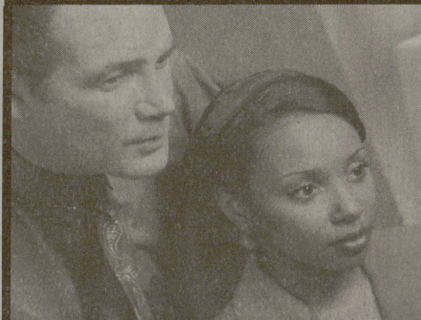
AGGIE OWNED AND OPERATED