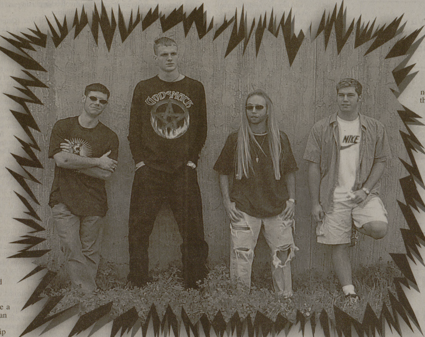
ILLUSTRATION BY CODY WAGES/THE BATTALION

The addition of Metrolis completed the lineup. Rip and Elkins had already hired a new drummer in March. "We've had bad luck with drummers," Elkins said. elymonth. For some reason, we get unreliable ones. We don't hear from them for a couple of weeks, then they'll call,