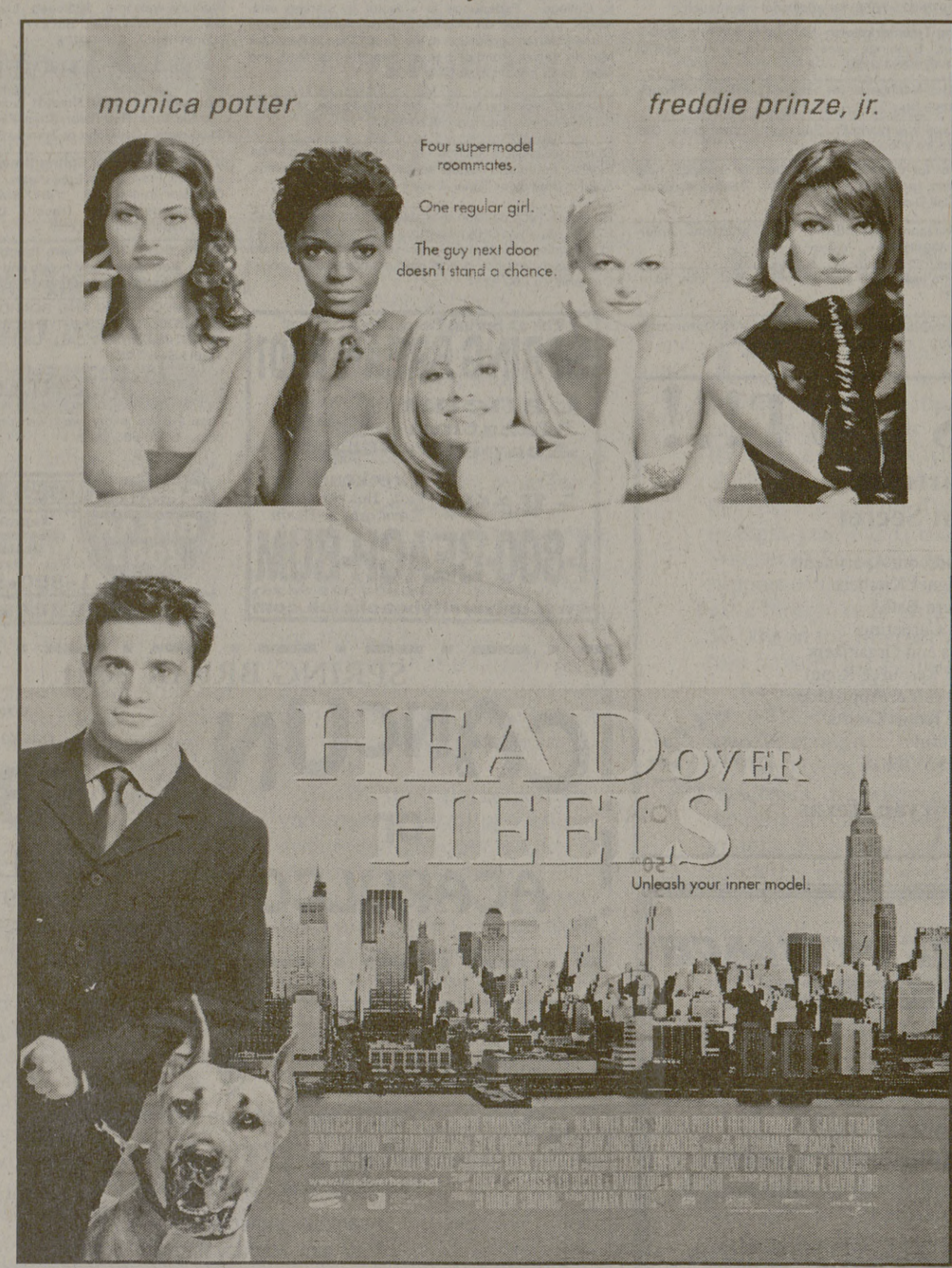
www.headoverheels.net AOL Keyword: Head Over Heels