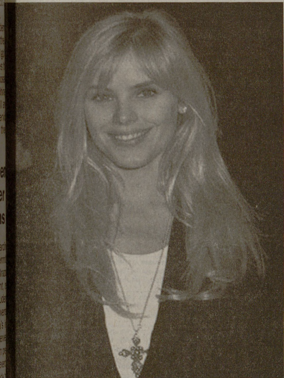
Gena Lee Nolin, former "Baywatch" actress, is returning to the small screen after a lengthy hiatus. She said she is trying to project a more staid image in order to be a role model for her son.

Nolin said she expects "Sheena" to do well in today's action-crazed market