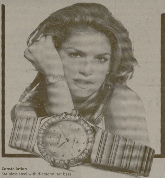
Constellation Stainless steel with diamond-set bezel. OMEGA - Swiss made since 1848.