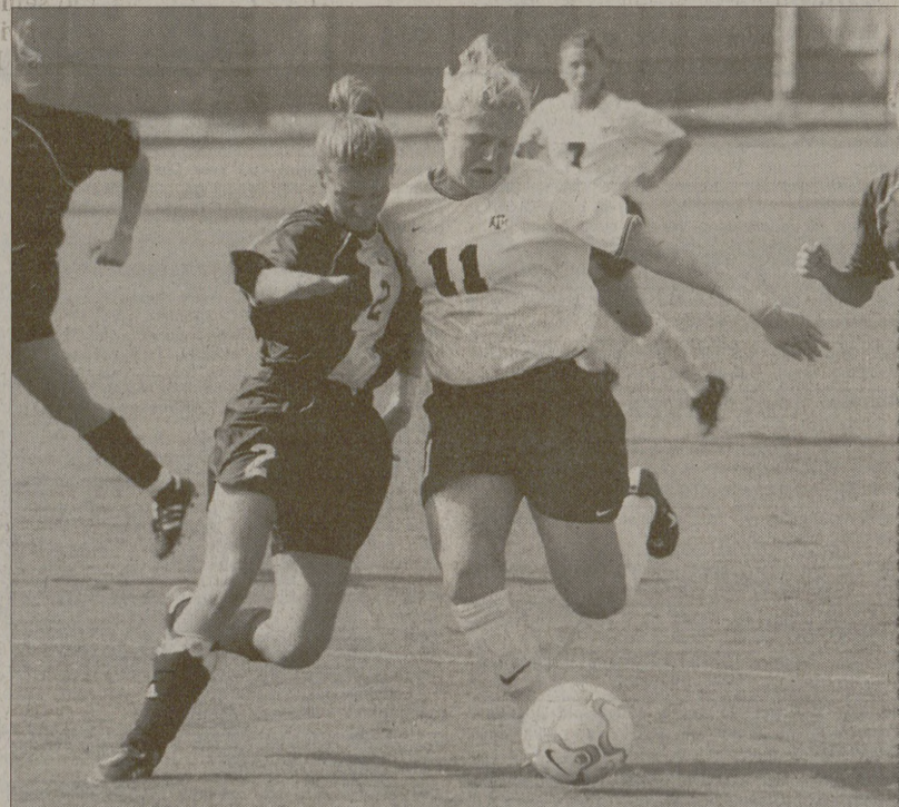
The Texas A&M soccer team travels to California Sunday to take on UCLA in the Sweet 16 of the NCAA tournament.

Sunday's matchup between the Bruins and Aggies will be the first meeting between the two programs. Kickoff is set for 1 p.m.