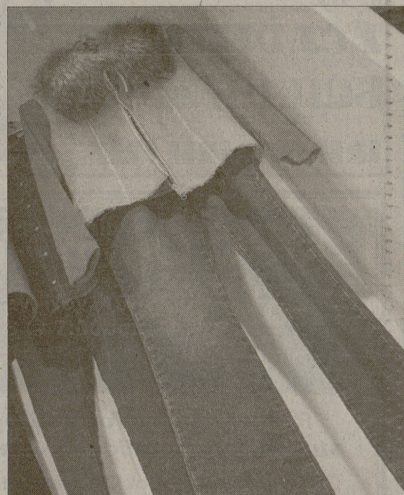
Faux fur makes its triumphant return