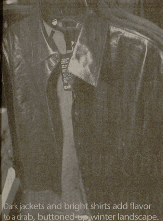
Dark jackets and bright shirts add flavor to a drab, buttoned-up winter landscape.