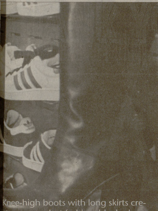
Knee-high boots with long skirts create a warm, but fashionable, look.