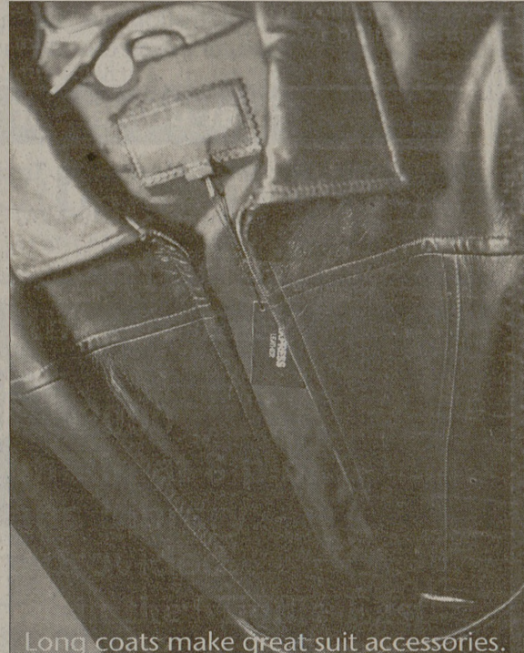
Long coats make great suit accessories.