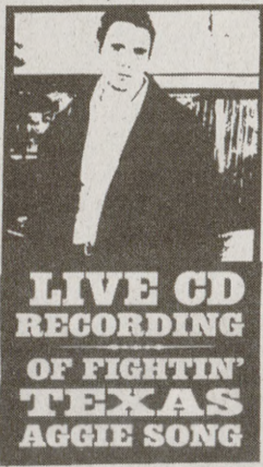
LIVE CD RECORDING OF FIGHTIN' TEXAS AGGIE SONG