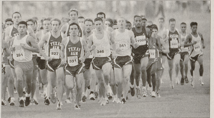
The Texas A&M cross country teams open the 2000 season at the Rice Relays today.

The team members anticipate this meet as a chance to begin their trek to nationals. Both the men's and women's teams plan to challenge one another and equal each other's success this season.