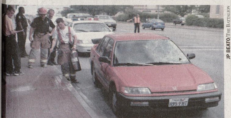
Members of the College Station Fire Department clean the sidewalk on Northgate after a Honda Civic struck a pedestrian crossing University Drive.

No information has been released on the driver, who is a minor.