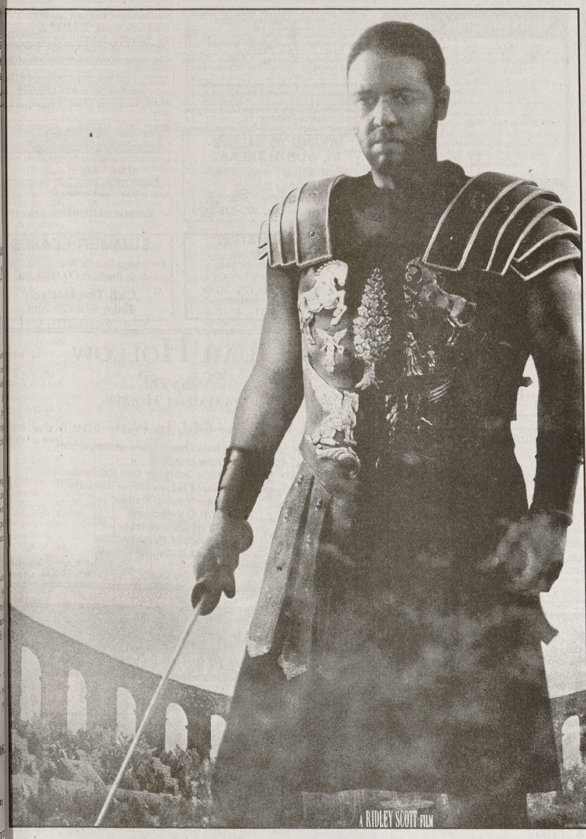
A RIDLEY SCOTT FILM

SENIORS MAKE SURE YOUR CLASSMATES KNOW YOUR NEW E-MAIL ADDRESS. VISIT MYFORWARDINGADDRESS.COM FOR YOUR COLLEGE E-MAIL ADDRESS AND YOUR NEW E-MAIL ADDRESS. Max out the Value of your Diploma and take a Vacation on Us! your hard earned diploma. Get your job and your diploma! Just show us your diploma and we'll waive your first apartment deposit. You will receive a 3 day/2 night vacation package with over 80 options to choose from. are looking for fine dining, shopping, a weekend getaway, a night out downtown, a new baseball stadium, a perfect paradise, it can all be yours. View. view features 15 apartment options that can accommodate all needs and price range. We are 20 minutes from Downtown Galleria, Woodlands, and the Medical Center. 's right, just stop by Cityview Leasing Center with your diploma and cash in on your vacation! us today! (281)822-0800 or visit www.cityview-apts.com We're Open 24-hrs at Cityview Leasing Center, 500 Greens Road, Houston, Texas 77006