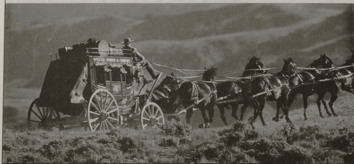
Member FDIC wells Fargo.com © 2000 Wells Fargo Bank (Texas), N.A.

Please join the Norwest staff you've always known as we celebrate our new name and a new stage in banking convenience. Stop by the Pavilion location on Friday, April 28 from 11:00 a.m. to 2:00 p.m. for refreshments and customer giveaways.