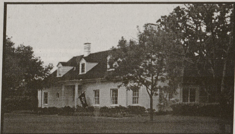
The Gilchrist-Southerland residence is located at 100 Throckmorton Street across from the Sanders Corps of Cadets Center.

Light refreshments will be served at both homes.