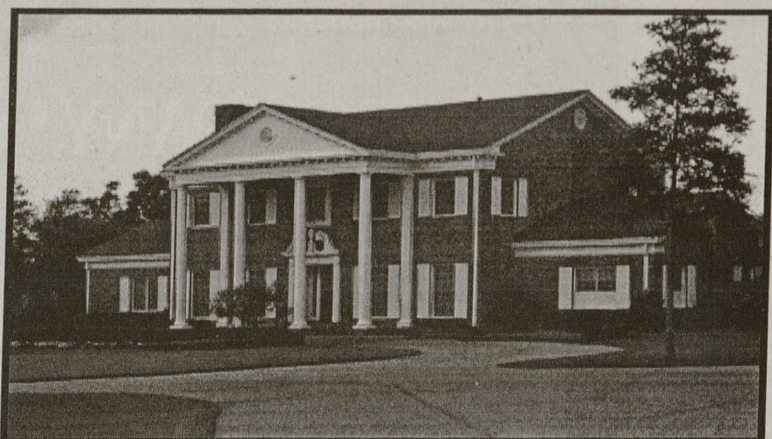
The President's home is located on Throckmorton Street across from Duncan Drill Field.