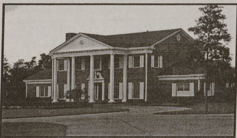
The President's home is located on Throckmorton Street across from Duncan Drill Field.