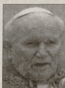
JOHN PAUL II

The hour at the Holocaust memorial was the emotional highlight of his groundbreaking visit to the Jewish state and sealed his legacy of unprecedented activism to reconcile Catholics and Jews. However, at an interfaith gathering hosted by the pope later Thursday, it quickly became clear that religious harmony is still difficult to attain in the troubled Middle East.