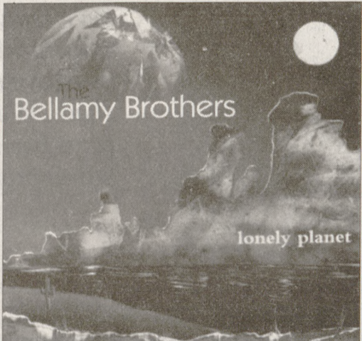
The Bellamy Brothers Lonely Planet

The Bellamy Brothers have been around for a number of years and they have definitely had their ups and downs. They are on one of their musical ups with Lonely Planet .