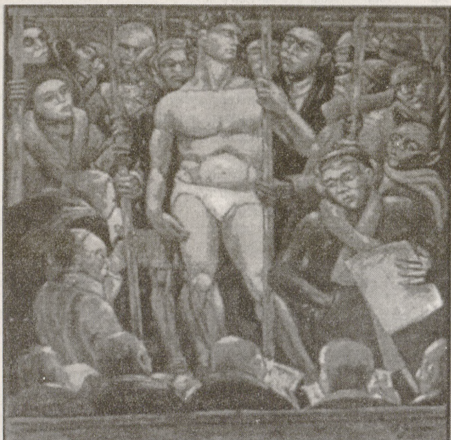
King David oil on canvas 1998