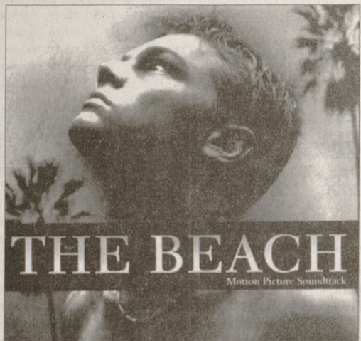
Various Artists The Beach Soundtrack London Records

The Beach Soundtrack is a great collection of unique and diverse tracks.