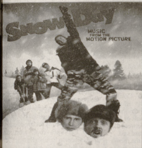
Various Artists Snow Day — Music from the Motion Picture Courtesy of Geffen Records

The Snow Day soundtrack features a wide variety of songs from a wide range of bands and singers — from The Hippos to The Mighty Mighty Bosstones. With these acts and several other solid bands, including Sixpence None the Richer, one might expect a fairly solid album. In reality, what one gets is a very lame album. There are two, or maybe three songs, on the album that are not about love or do not mention love less than twice.