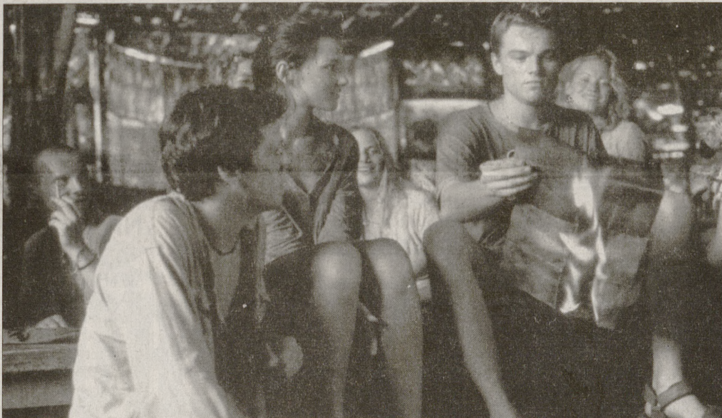
(L to R): Etienne (Guillaume Canet) and Francoise (Virginie Ledoyen) watch Richard (DiCaprio) burn a map, which is incomprehensible, but that guy can really act. Demonstrating his contempt for playing it safe with films, DiCaprio plays the tragically flawed hero Richard with such skill that an audience is not sure whether they want to cheer for his character or wish him the worst.

DiCaprio may have received $20 million for this