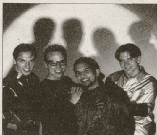
First Love First Love JWP records

Writing a negative CD review is a difficult thing. A writer can not help but feel a pang of guilt at times thinking about all the hard work that went into producing the monstrosity before him or her.