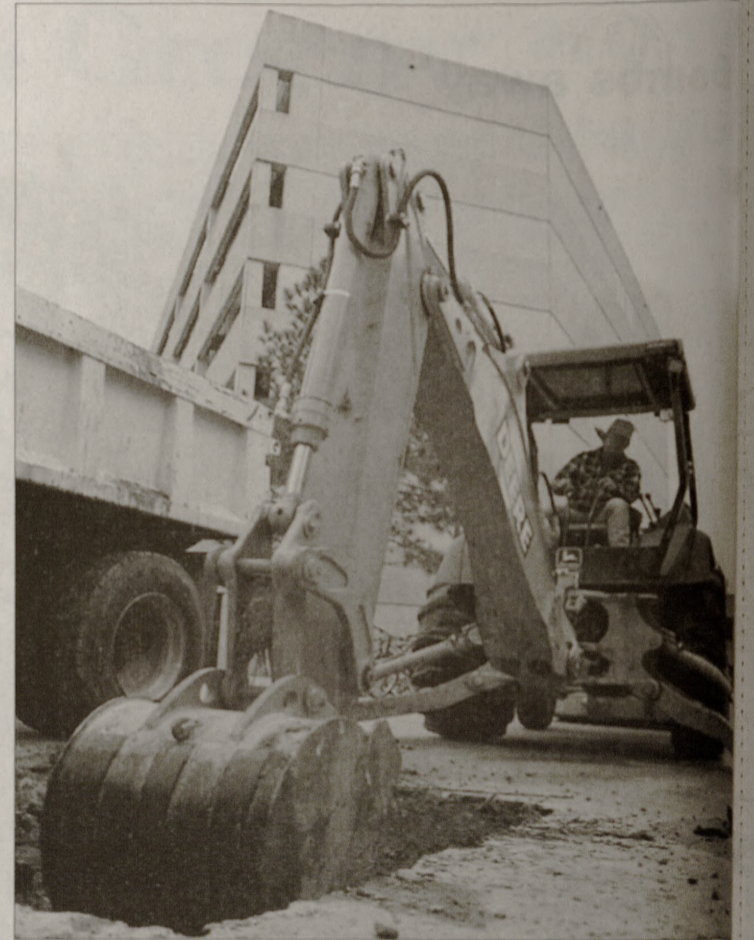
Steve Harris, a contractor for the University Physical Plant, digs up the walkway outside the Blocker building Wednesday so repairs can be made to the broken water main. Bathrooms in Blocker and Habbouty were shut down due to the problem.