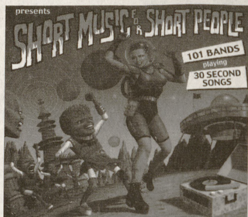
Various Artists Short Music for Short People Fat Wreck Chords

Continuing its tradition of producing great compilation CDs, Fat Wreck Chord's latest compilation, Short Music for Short People is an impressive collection of 101 songs that clock in at 30 seconds or less from 101 different bands, not all necessarily on the Fat Wreck Chords label. The album showcases the many different sounds of punk music. It could be used as a crash course in punk music for those unfamiliar with the genre. The producers wisely (or accidentally) accentuate the differences among the sounds by placing the most unlikely tracks side by side. Bouncy, pop-tinged tracks are juxtaposed with stark acoustic tracks that mingle with ska-influenced songs, and so forth, leaving listeners to guess what will come after the pause between tracks. The album features almost every punk band under the sun, ranging from pioneers like The Descendents to more mainstream bands like Green Day, but mostly it showcases bands that don't get the amount of attention they deserve like Bracket and Good Riddance. The 30-second-or-less length of each song is both the CD's greatest weakness and its greatest asset — listeners may long for a track to last longer, but wish another would end before it began. However, by the time the listener finds the remote control to his or her CD player, chances are the offending track is already over. (Grade: A+)