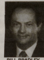
BILL BRADLEY DEM. CANDIDATE

"I am not quitting. We're going forward. We have another day."