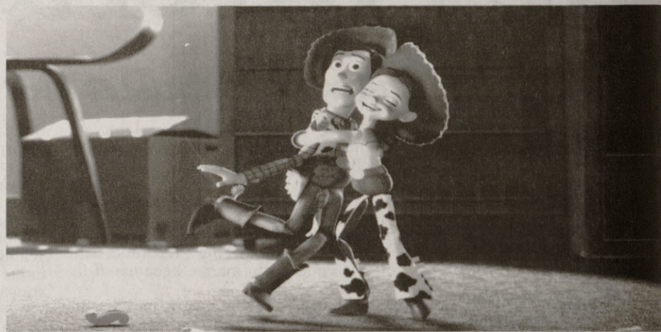
Woody gets rousing welcome from Jessie the cowgirl, a TV co-star from his show "Woody's Roundup."