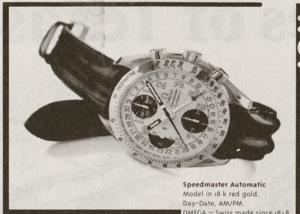
Speedmaster Automatic Model in 18 k red gold. Day-Date, AM/PM. OMEGA - Swiss made since 1848.