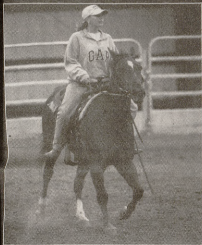
The Texas A&M Equestrian Team is one of two new varsity teams at A&M. The Aggies have won seven of the nine shows they have participated in this season and will host three shows Nov. 13-14 at Dick Freeman Arena.

The Aggies will resume action when they host three Western shows on Nov. 13-14 at Dick Freeman Arena.