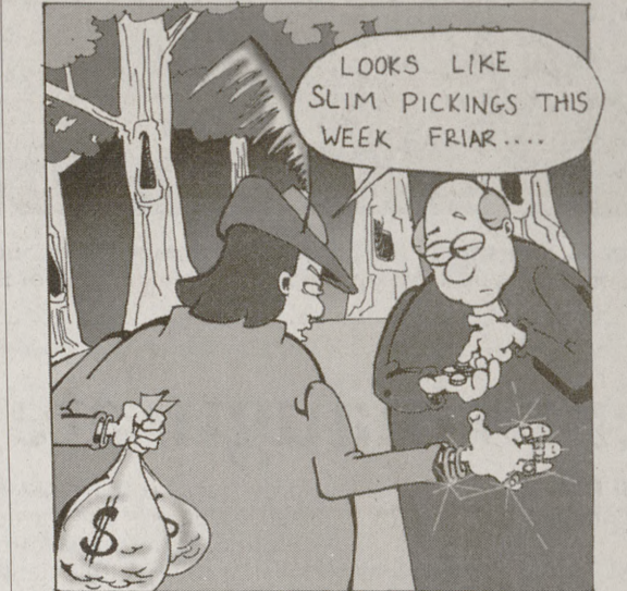
Things just seem less "merry" in Sherwood Forest these days