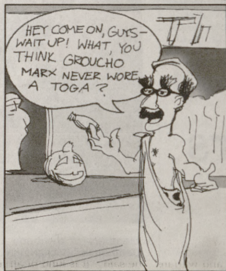
Once again, Jimmy waits until the last minute to buy a Halloween costume.