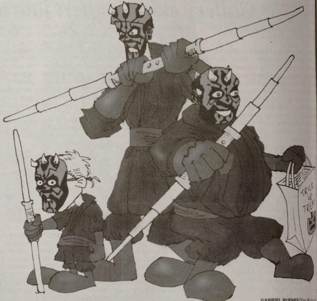
GABRIEL RUENES/TIM BROWN

Above all else, the power of imagination and story is the true magic behind Halloween. It is the time to unleash the fiery energy of the child's imagination and to lose oneself in "What if?"