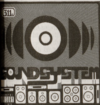
311 Soundsystem CD

311 has been around for quite a while and has pumped out a few CDs during their time. Their unique style brought them fame with the self-titled album in 1995, launching them to stardom. Sadly, though, their next album, Transistors , was a bit of a letdown. The new album, Soundsystem , seems to take from what made their famous self-titled album so original. In this album the band gets back to its rock roots while still experimenting with reggae and hip-hop.