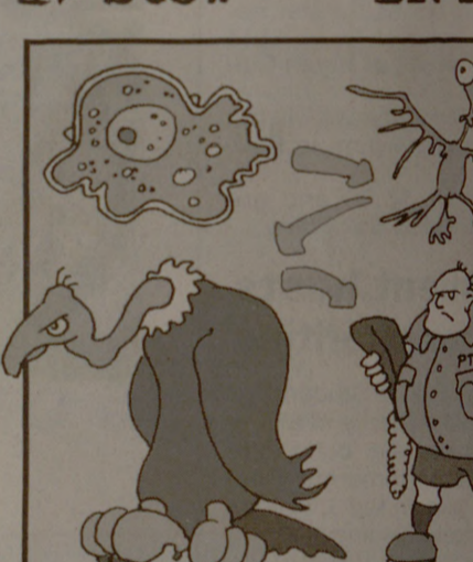
THE EVOLUTION OF THE VULTURE