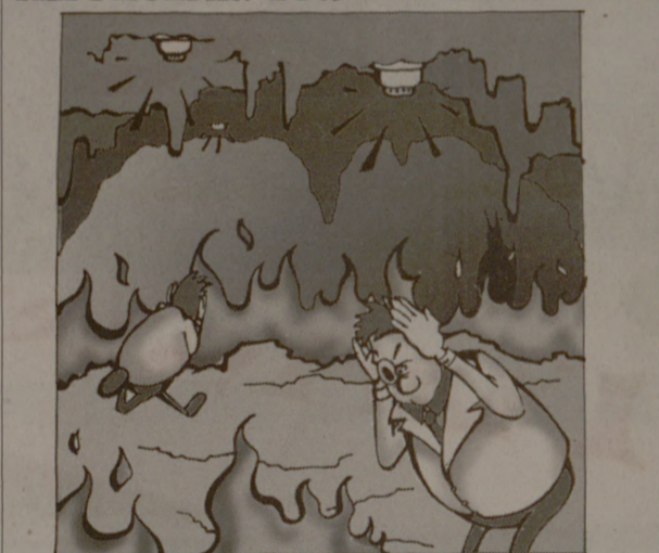
People could tolerate the merciless torture, the terrible heat, and the vicious ridicule, but it was the incessant beeping of the smoke alarms which finally drove everybody mad.