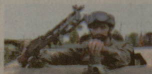
Troops in Kashmir