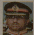
Gen. Pervez Musharraf