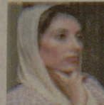
Benazir Bhutto Feb. 1997

Throughout Pakistan, people took the news of the army takeover and Prime Minister Sharif's dismissal with indifference. Here are some major events that led to Tuesday's coup.