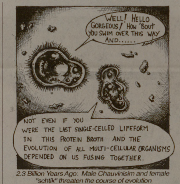
2.3 Billion Years Ago: Male Chauvinism and female "schtik" threaten the course of evolution