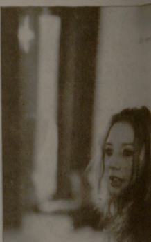
Tori Amos To Venus and Back CD

Tori Amos combines music with live versions of older, classic music in her double-disc set.