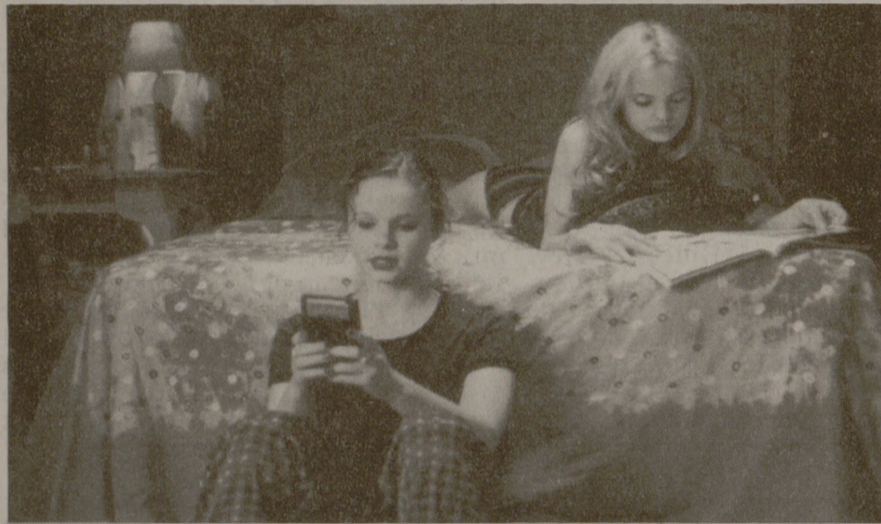
Thora Birch (left) and Mena Suvari co-star as teenage friends caught in a twisted family drama, in the DreamWorks film American Beauty .

When the film shifts to its more serious and thought-provoking theme a little less than mid-