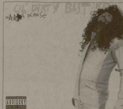
Ol' Dirty Bastard N***a Please CD courtesy of Elektra Records

Between countless curse words and horrendous singing, Ol' Dirty Bastard delivers an album lacking both talent and creativity, with beats and baselines as tired as a college student after an all-nighter.