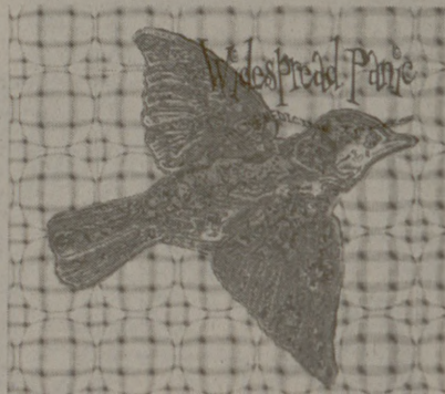
Widespread Panic Till the Medicine Takes CD

"Till the Medicine Takes, the latest and undoubtedly best release by folk-rockers Widespread Panic, combines grassroots blues with an eclectic mix of percussion, horns and electric guitar. The band expands musically through a variety of instruments and attacks each vocal with an enthusiasm and passion that makes its music better with each track.