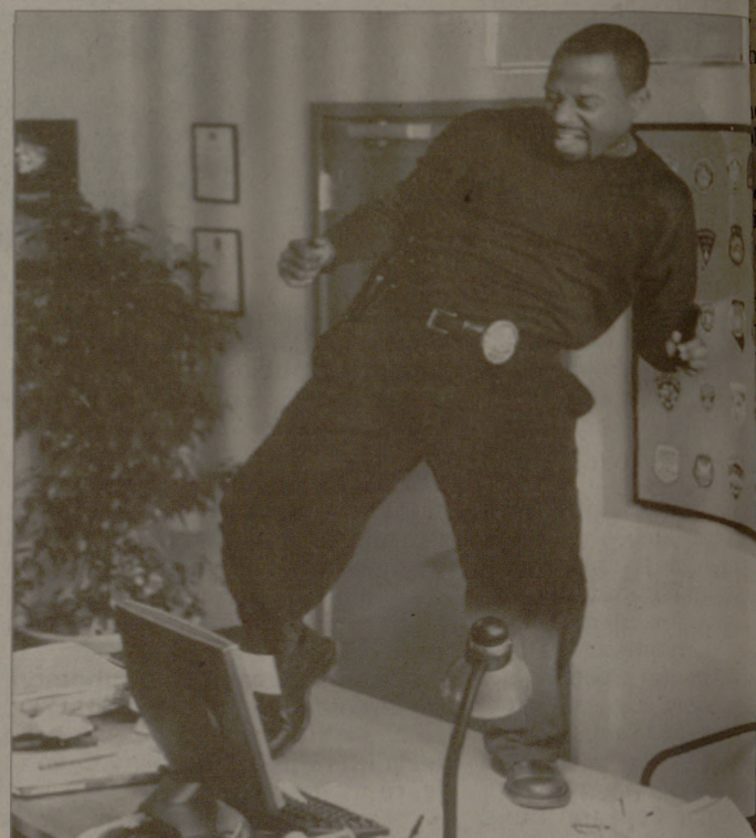
Martin Lawrence impersonates a cop to get a diamond, in Blue Streak .