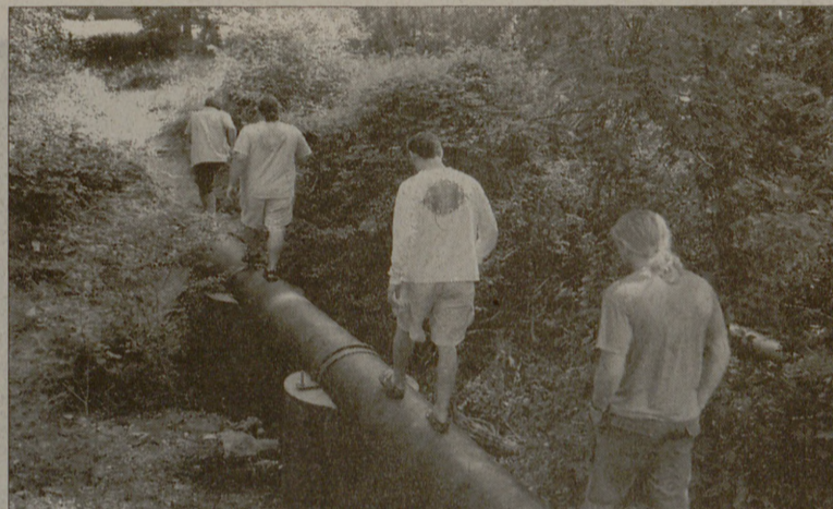
The members of local band Last Free Exit will host a CD release party for their newest effort, A Day Waiting , Thursday at Shadow Canyon.