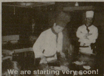
We are starting very soon!

We now provide tepanyaki ready to cook at your table!