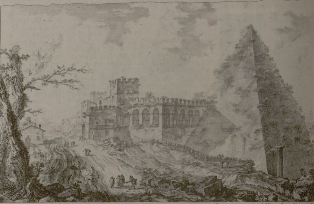
Two examples of the lithographs created by Luigi Rossini and Giovanni Piranesi on display for the J. Wayne Stark Gallery's "Classical Masters" exhibit.