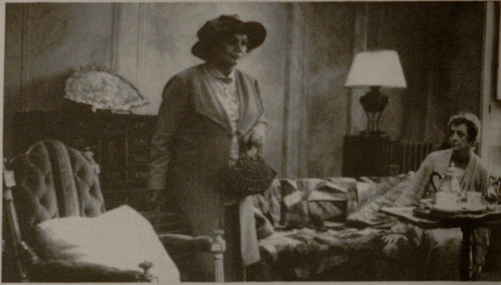
Plowright and Smith play two English ex-patriots living in Florence, Italy, in G2 Films' Tea With Mussolini .