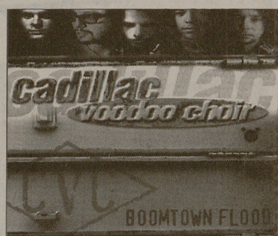
Cadillac Voodoo Choir Boomtown Flood CD

Cadillac Voodoo Choir will play their '70s driven rock and roll tonight at 8 at the Texas Hall of Fame.