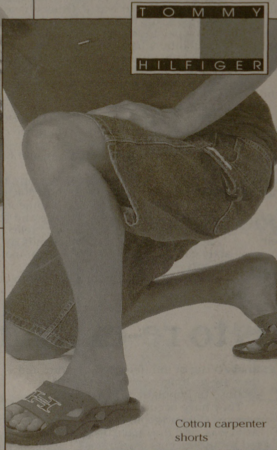
Cotton carpenter shorts