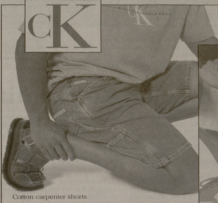
Cotton carpenter shorts