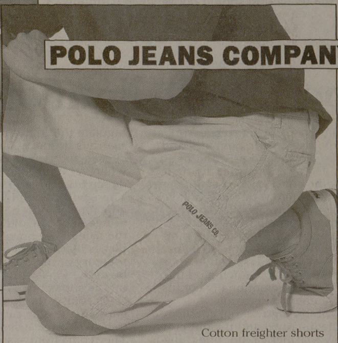
Cotton freighter shorts