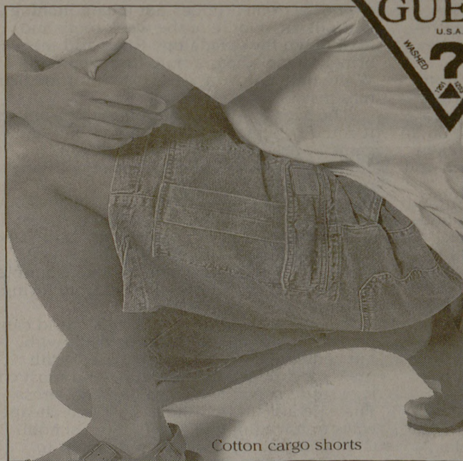
Cotton cargo shorts