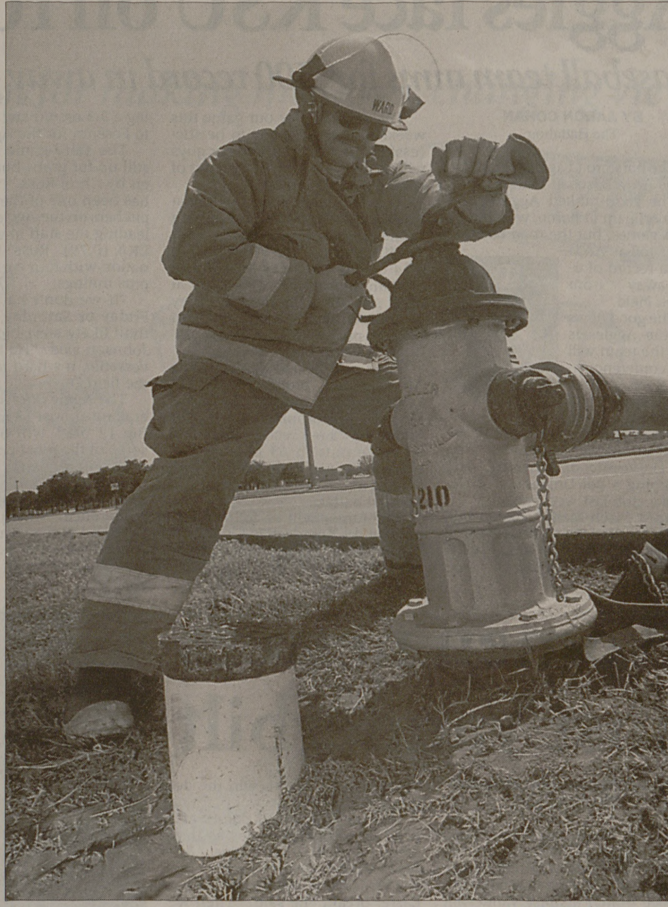
WIKE FUENTES/THE BATTALION