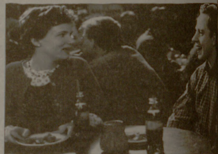
Juliette Lewis and Giovanni Ribisi find selves falling in love in The Other Sister