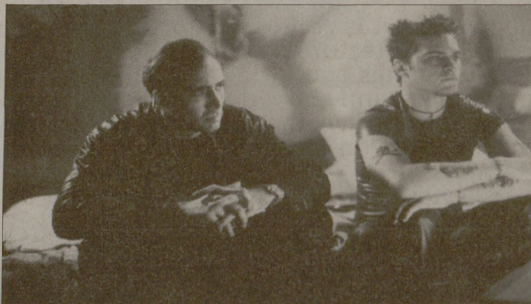
Nicholas Cage and Joaquin Phoenix pair up to discover the whereabouts of a girl in 8MM